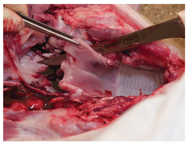
Tonsils are another tissue that can be tested for ASF. Spleen is the preferred specimen when possible.

Brookings, SD; www.sdstate.edu/veterinary-biomedicalsciences/animal-disease-research-and-diagnostic-laboratory